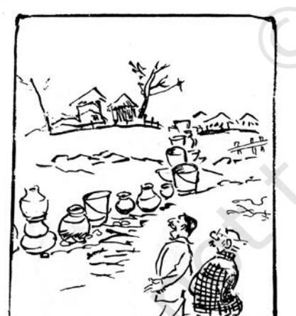
Not bad! One of the taps in the nearby village must be getting water!